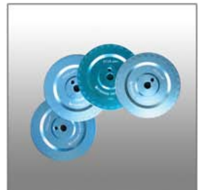
Various Plates (SS06,10,16,20)